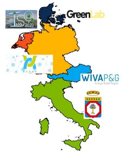
Figure 1 National cases

SuperP2G interconnects leading P2G initiatives in five countries, ensuring joint learning. Each national project focuses on different challenges, where researchers team up with local need-owners to co-create solutions. SuperP2G focuses on improving existing tools including open access, as well as develop a new open tool based on the OptiFlow and H2IndexII tools. This is supplemented with analysis of regulation and markets, as well as stakeholder involvement.